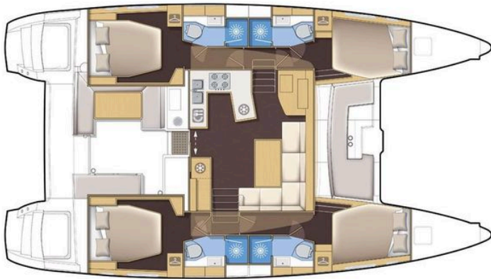
Version 4 cabines / 4 cabin version